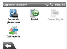
Integrated Phone Menu.