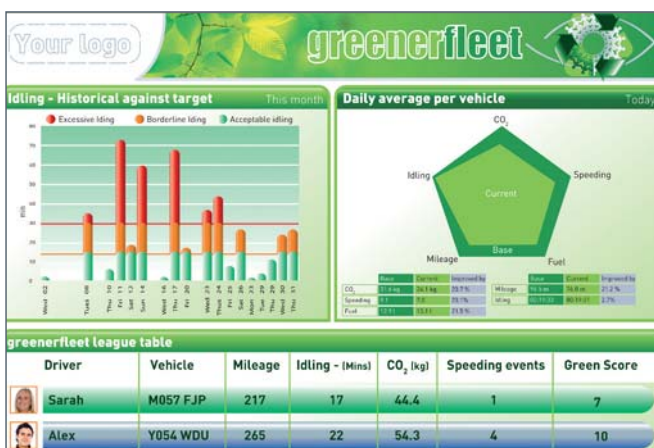
Your Greenerfleet data can be displayed on a large Masternaut Visulive display for all to see

GreenerFleet allows you to track the performance of your vehicles over time across a range of factors so that you can see the results of your efforts to improve driver habits and also to reduce unnecessary road miles. Comparing your current performance to a baseline, you are able to track improvements in speeding, engine idling, CO2 emissions and also use of fuel. This is conveyed through a unique visual graphic.